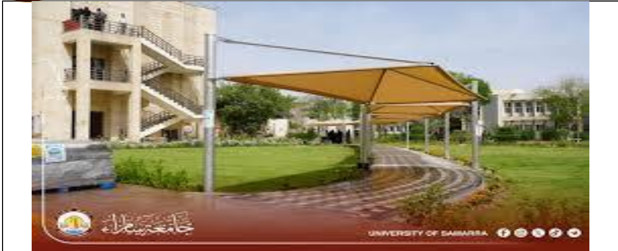
Campus Setting -College of Management and Economic, University of Samarra, Samarra- Iraq