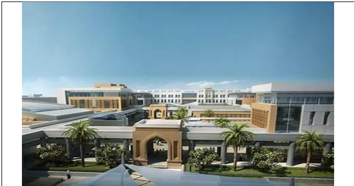
Campus Setting -University of Samarra, Samarra, Iraq )