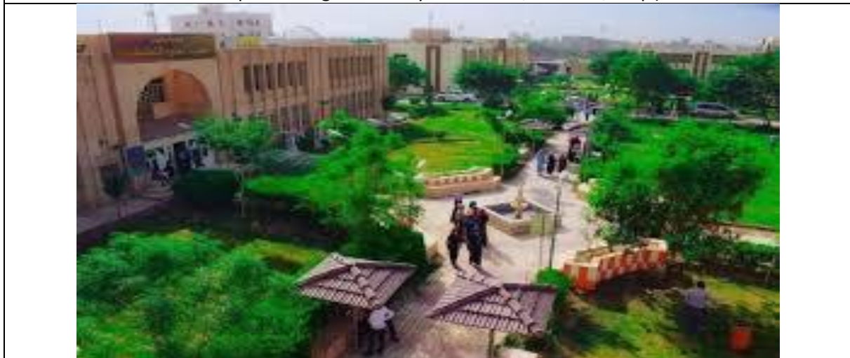
Campus Setting - University of Samarra, Samarra, Iraq