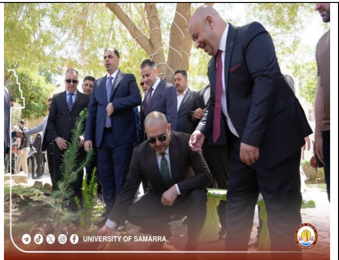
Samarra University launches activities of Sustainable Energy Week