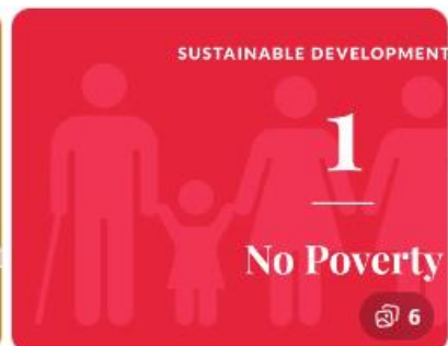
Events Related to Sustainability (University of Samarra)